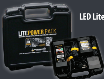
LED LitePower Pack

LiteRibbon™ Kits include everything you need to start using LED LiteRibbon™ in Tungsten, Daylite, and Hybrid white colors. Choose from 30 different kits like our "Basic" and "Simple" entry-level kits, or choose one of our Pro "Reality," "Commercial," or "Feature" kits. There is even a Pro "Car" kit that includes nearly 17 sections of LiteRibbon™. Kits include VHO Pro LiteRibbon™, Chroma LiteRibbon™, LiteStix Pro units, and the all-inclusive LitePower Packs that include power supplies, dimmers, cables, adapters, and battery adapters.