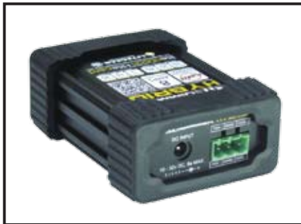
LiteDimmer Connections Panel