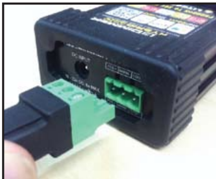
Rear Panel, showing HyConn Connector