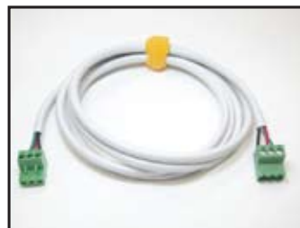
LitePower HyConn Cable Extension

LiteDimmer's offer a beautiful, full output dimming range from 0 to 100%, and also includes a "Low Mode" that dramatically increases the range of adjustment on the low-end allowing appropriate level control when working at low light levels. A "Two Channel" mode also allows LiteDimmer Hybrid to function as 2 "Single" dimmers when needed.