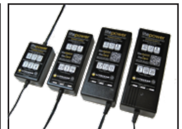
LitePower Power Supply

lite TM ribbon & litecard FOR USE WITH THE LED BUILDING BLOCKS FOR YOUR NEXT GREAT IDEA