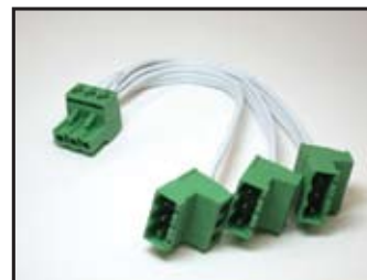
LitePower HyConn ThreeFer