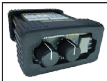
HideAway Dials Enabled