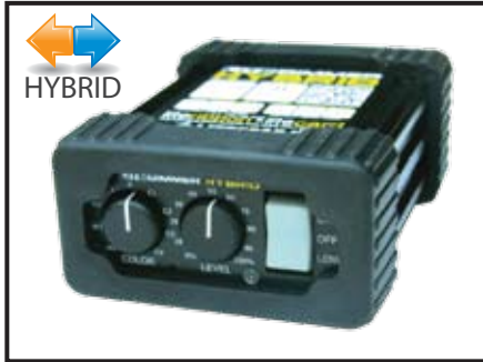
LED LiteDimmer Hybrid